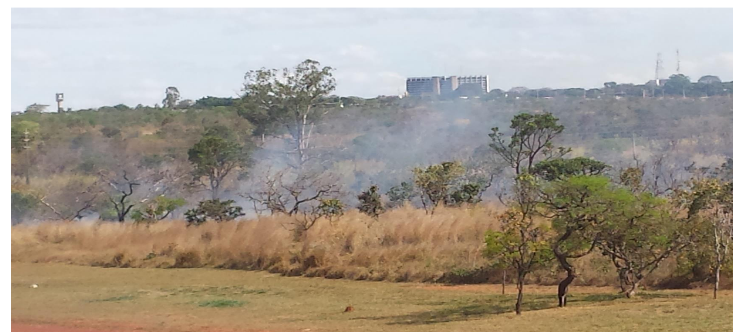
Figure 2. Spontaneous “Cerrado” forest fire. Brasília/DF, 2017.