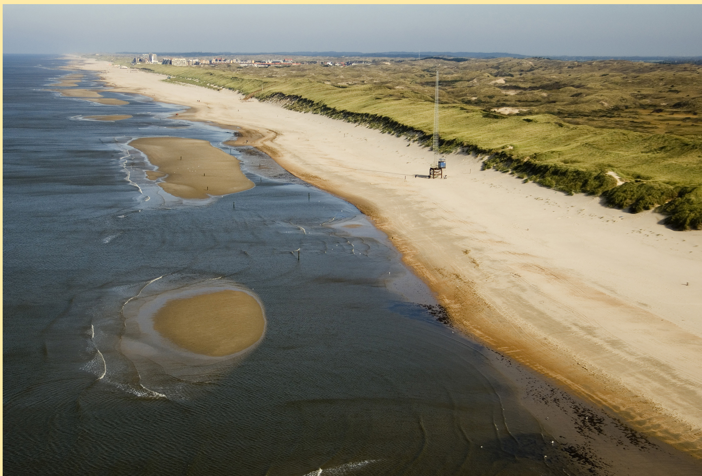
Figure 1 The beach at Egmond is bordered by a 20-m high, 1:2 sloping foredune.

(Figure 2b) The wind at the beach-dune interface is steered alongshore. The steering is maximum (about 15^\circ ) for shore-oblique winds, and minimum for onshore and almost alongshore winds.