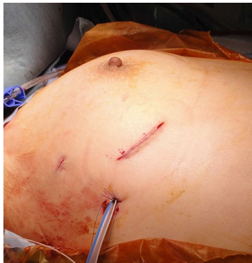
Figure (2):- Mini-thoracotomy approach