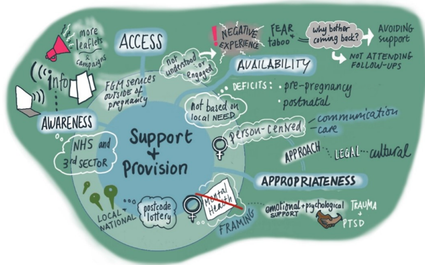
Figure 3. Influences on decision-making for deinfibulation.docx available at https://authorea.com/users/485421/articles/570820-preferences-for-deinfibulation-opening-surgery-and-female-genital-mutilation-service-provision-a-uk-qualitative-study